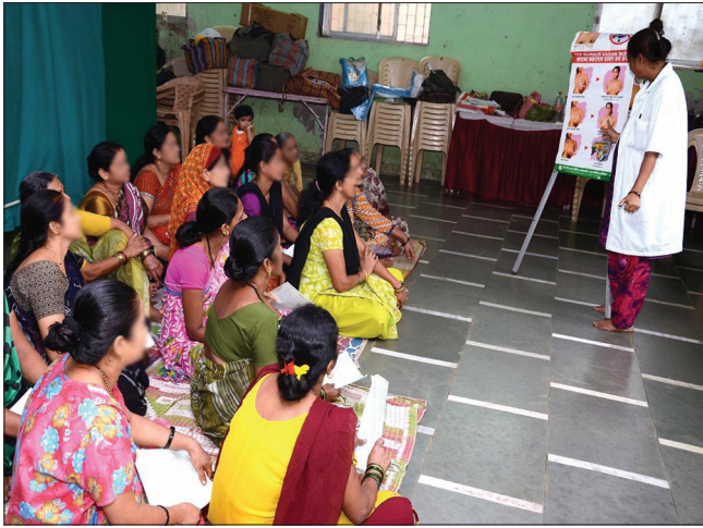
Figure 1: Health education session