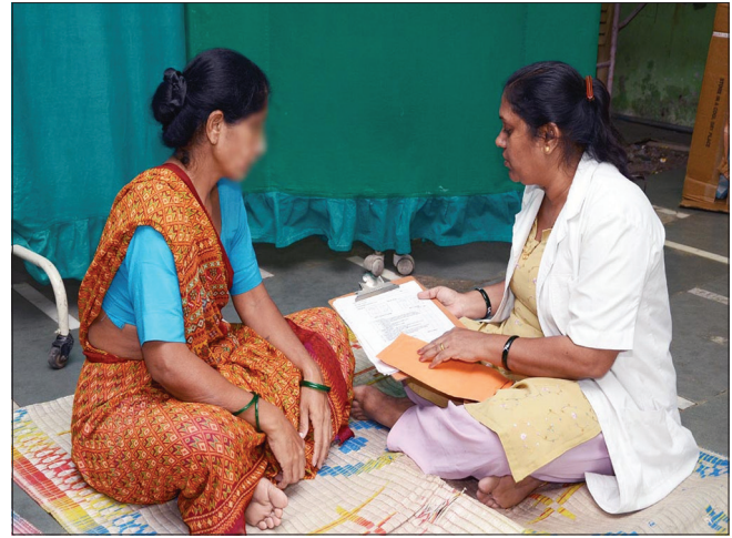
Figure 2: Counseling by project staff