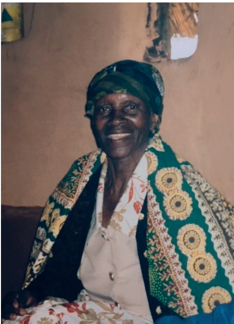
Smiling, valued and useful to the end – despite Parkinsonism and mobility issues. My wish for every-one getting older (meaning all of us).

Throughout history, traditional birth attendants have been the main health care providers for women during childbirth in Africa. They attend to the majority of deliveries in the rural areas of developing countries. When a woman is pregnant, who best can answer all the questions except grand mum, who herself has undergone the experience if not several times and over the years has accompanied many. Traditional midwives have been an integral part of African medicine for centuries. Because African people still love and fear spirits, they bring in a complementary component to conventional health care service, hence they are highly respected in African communities as they perform cultural rituals and provide essential social support to women during childbirth [19,20]. With additional formal training, traditional midwives, these grandmothers can be considered an important part of the informal community health care system [19].