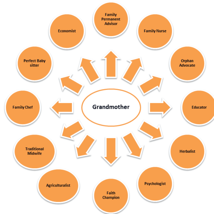
Figure 1. Summary of roles played by grandmothers in Africa.

well as practical skills to heal. Learning to heal is not only embedded in everyday practice and in social relations, but is also a moral and emotional process in Africa [9].