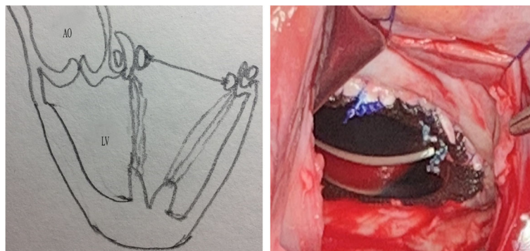
Fig. 3 The preserved tissues are placed between the mechanical valve and the original annulus. Mechanical mitral valve implantation. AO, aorta; LV, left ventricle

Short-term Complications: After six months of follow-up, the operative mortality was zero, and there was no incidence of infective endocarditis or prosthesis dysfunction in all the three groups. The incidence of low cardiac output syndrome (cardiac index < 2 \text{ L} \cdot \text{m}^{-2} \cdot \text{min}^{-1} ) in group A was lower than that in group C ( p = 0.011 ). There was no left ventricular posterior wall rupture or mechanical valve dysfunction in group A. The short-term complications are shown in Table 3.