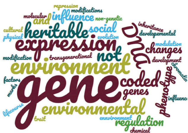
Figure 1. Word cloud built from the written answers to the survey (by using www.wordclouds.com ).

Unsurprisingly, it happened that the definition is not fixed, but rather broad and blurry. Importantly, when each discipline was asked to give a single word