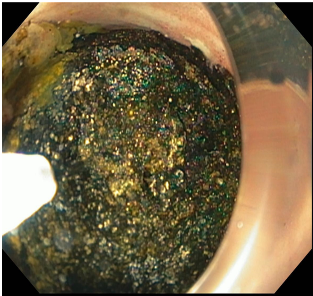
FIGURE 2: Upper endoscopy showed a large impacted stone in the second portion of the duodenum

Several endoscopic foreign body and stone retrieval devices, as well as lithotripsy, were attempted to remove or fragment the stone. However, the stone was impacted and exceedingly larger than the available endoscopic retrieval devices. Another attempt was made to inflate the controlled radial expansion (CRE) dilation balloon beyond the impacted stone and drag the stone into the stomach for fragmentation, but it was unsuccessful (Figure 3).