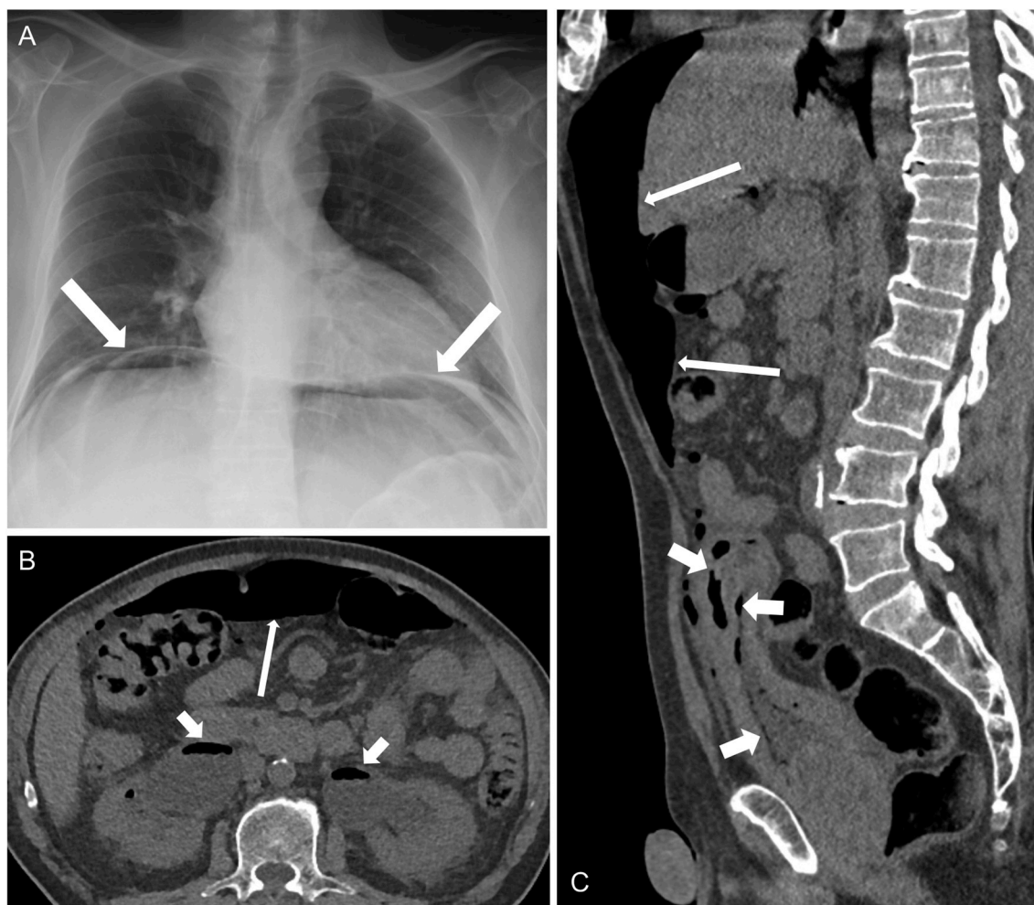
Fig. 1. (A) Portable chest radiograph shows a large amount of free air beneath the diaphragm. (B) Axial non-contrast CT shows a large amount of intraperitoneal free air (long arrow) and air within bilateral dilated collecting systems (short arrows). (C) Sagittal non-contrast CT shows a large amount of intraperitoneal free air (long arrows), and air within the bladder wall, bladder lumen, and in the necrotic dome of the bladder (short arrows).

which was sent for culture. A full examination of the bowel failed to identify any evidence of a perforation. Attention was then turned to the bladder. The intraperitoneal portion of the bladder was grossly abnormal, appearing fibrotic and devitalized. A small 3–4 mm defect was identified at the bladder dome within a large area of necrosis (Fig. 2a). Concurrent cystoscopy confirmed the bladder perforation and revealed diffuse inflammation, trabeculations, and diverticula. A partial cystectomy was performed with removal of a 7 × 5 cm segment of necrotic bladder tissue notable for several discrete abscess