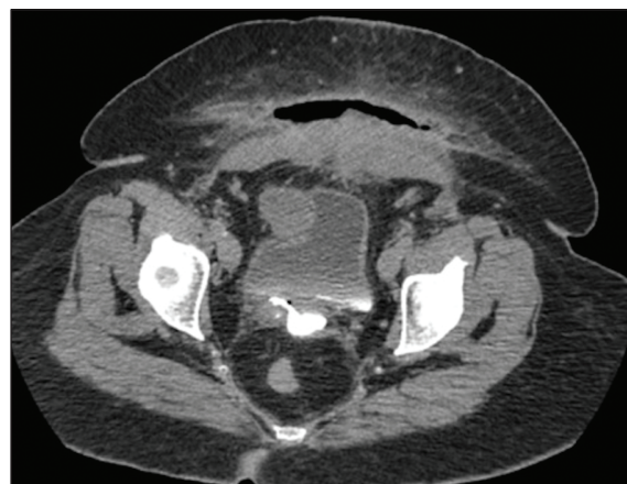
Fig. 1. Computed tomography (CT) urogram demonstrates a distal ureteral stricture and uretero-vaginal fistula.

The patient remained symptom-free until the third week, where she developed left flank pain and urinary vaginal discharge. Speculum exam demonstrated significant vaginal discharge at the posterior fornix. Cystoscopic examination was normal. Computed tomography (CT) urogram revealed a distal ureteral stricture and uretero-vaginal fistula. These findings were compatible with a ureteral injury most likely during vaginal vault suspension (Fig. 1).