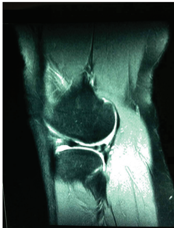
Fig. 1 - NMR on the right knee, showing the bucket handle tear in a longitudinal slice.

Lachman test (grade III) and subluxation with crackling in the pivot shift test. NMR showed a bucket handle tear of the medial meniscus, with displacement of the fragment into the intercondylar region, tearing of the lateral meniscus, joint effusion, grade II femoropatellar chondropathy and ACL tearing (Figs. 1 and 2).