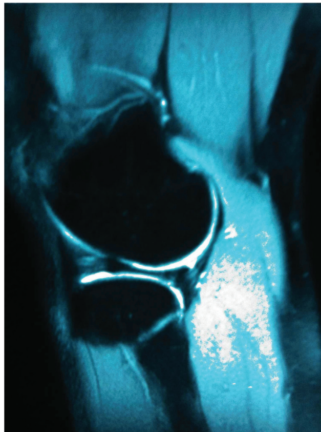
Fig. 4 - NMR on the right knee, one year after conservative treatment, with spontaneous resolution of the bucket handle tear seen in a transverse slice.