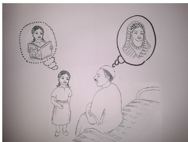
Figure 2 Example illustration from dissemination: limited autonomy and decision-making influence of girls and women.

Community dissemination meetings were hosted to 'member check' preliminary analysis 16 ; this involved sharing research findings with study participants and those from the same or similar population groupings to confirm interpretations of the research team during analysis and to elicit further community reflections on the findings. 14 Visual methods were used in this process