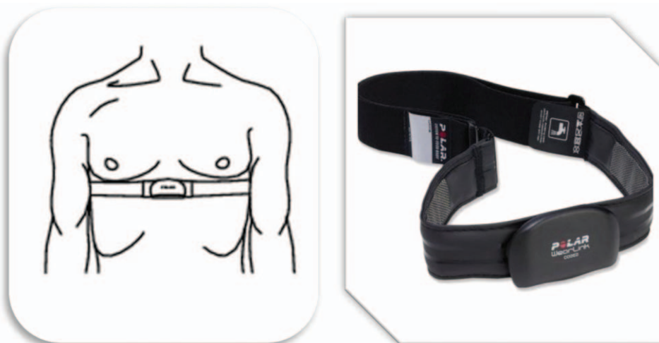
Figure 2. Placement of the strap on the patient. [23]

All patients will be assessed at the beginning of the exercise and every 5 minutes throughout the 30 minutes of the active phase, the HR and BP will be measured by the Bellco Formula Plus dialysis machine (Formula 2000 plus Domus SW 5.8, Mirandola, Italy) (Fig. 4).