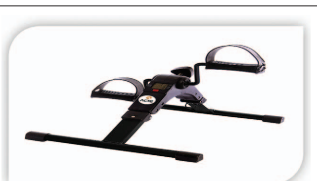
Figure 5. Mini bike compact - E 14.