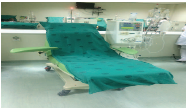
Figure 4. Maca next to the monitoring device where the patient will perform the exercises.

The KDQOL-SF protocol will be used to evaluate QoL. It is a self-enforcing questionnaire of 80 items divided into 19 dimensions. It includes the short-form health survey as a generic