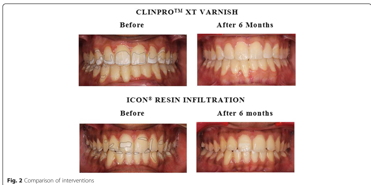
Fig. 2 Comparison of interventions