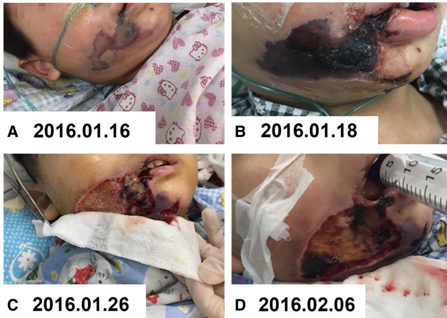
Fig. 1 a The dark red ecchymosis of the local skin was seen to extend from the right sulcus to the lower forehead. b The ecchymoses had dispersed to the entire right cheek and parts of the lower jaw, following which, the skin and subcutaneous tissues appeared black and were hard to the touch. c The necrotic tissue under the clam-shaped zone was removed, exposing a large tissue defect of a triangular area in the right cheek and mandibular region. d Continued physical therapy that kept the mouth opening for two hours, for a frequency of 3-4 times each day

To reduce the restriction of the mouth opening because of fibrous scar contractions, the responsible nurse used a clean 20 ml syringe to replace gags (a device for keeping the patient’s mouth open during a dental or surgical operation) from the third week after admission, and continued physical therapy that kept the mouth opening for two hours, for a frequency of 3–4 times each day (Fig. 1d). On January 29, 2016, the patient was transferred to a medical department to continue anti-infective management, wound care, nutritional support and other symptomatic treatment options. Further, the defective area of the right cheek and jaw was seen to be gradually reduced (Fig. 2a), and the