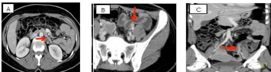
Fig. 2. (A,B&C): CT scan with contrast of the Abdomen showing left ovarian vein thrombosis.