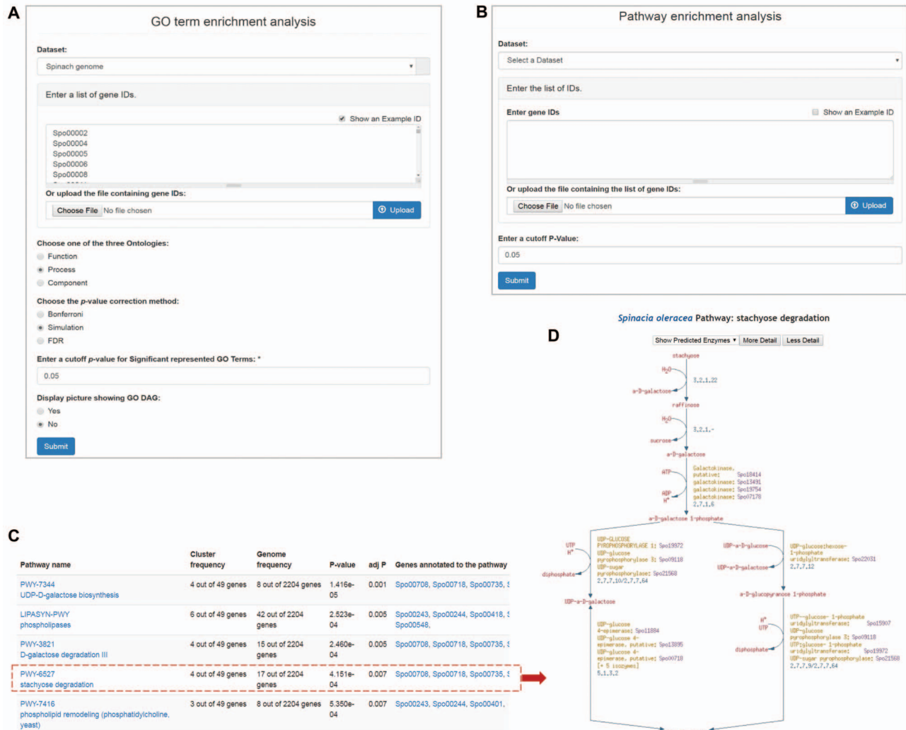
Figure 3. Enrichment analysis tools in SpinachBase. Query interfaces of ‘GO term enrichment analysis’ (A) and ‘Pathway enrichment analysis’ (B) tools. (C) Result page of ‘Pathway enrichment analysis’. Pathway names are linked to the specific pathway pages in the SpinachCyc database (D).

genes identified by BLAST, GO terms and InterPro domains. The search tool allows for an efficient retrieval of the spinach genome features. The features can be searched using filters such as feature type, name and keyword. Keyword can be any word or word combination of aforementioned functional annotations. The search tool outputs a table with names, types and functional descriptions of the matched features, which are linked back to the corresponding gene feature pages (Figure 2C).