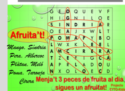
Alphabet soup sticker