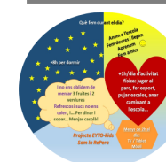
Figure 1 Activities in the European Youth Tackling Obesity-Kids project designed and implemented by adolescent creators (ACs).