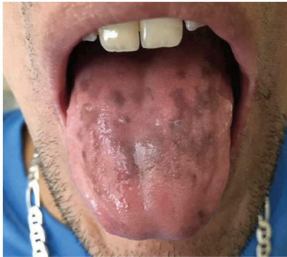
Figure 1. Showing oral candidiasis.