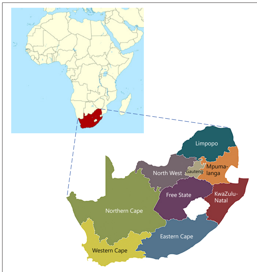
Fig. 1. Map of Africa and SA showing the 9 provinces in SA.