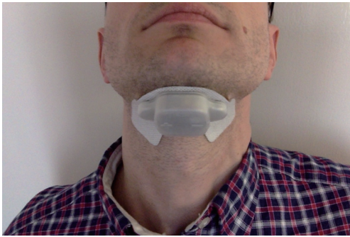
Figure 2 Picture of one of the prototypes of the TESLA programme attached to the submental area.