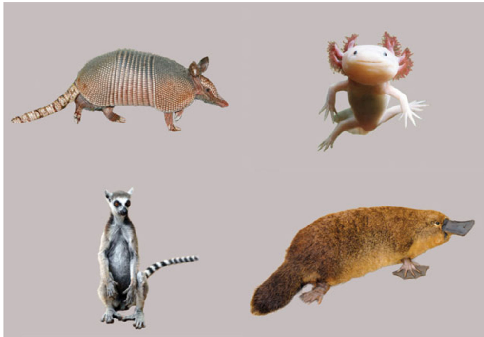
Fig. 1. The four animal pictures used in the experiments.