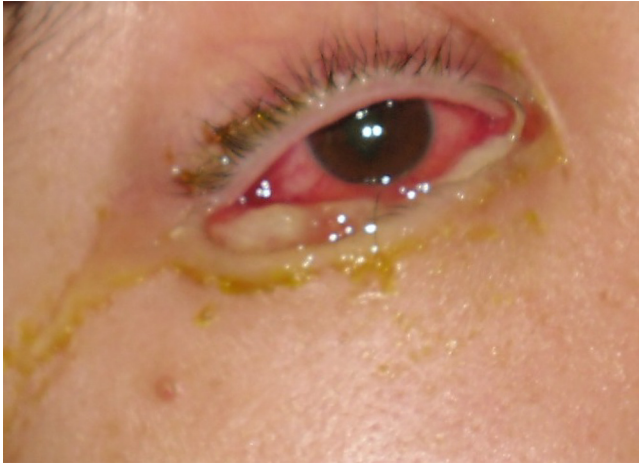
FIG 3 A previously healthy 33-year-old Chinese male presented with endophthalmitis.

similarly, five XDR ST11 cKp K. pneumoniae strains, harboring bla_{KPC-2} , bla_{CTX-M-65} , and bla_{TEM-1} , that acquired an hvKp virulence plasmid caused a uniformly fatal outbreak of ventilator-associated pneumonia in China (22).