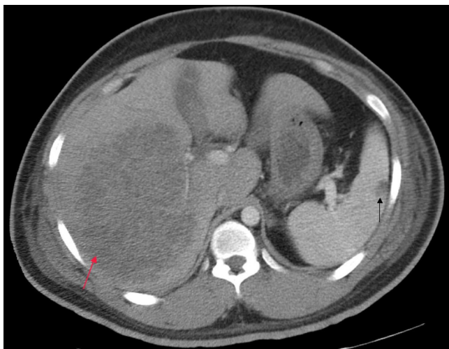
FIG 2 An image from an abdominal CT scan of a previously healthy 24-year-old Vietnamese man shows a primary liver abscess (red arrow) with metastatic spread to the spleen (black arrow).

Gram-negative bacillus isolated from PLA in the Asian Pacific Rim (238). Since then, the predominant pathogen of PLA in this region has been steadily shifting to K. pneumoniae , mirroring the increasing prevalence of hvKp over the same period. By 2004, approximately 80% of all cases of PLA in Taiwan were caused by K. pneumoniae (239–242).