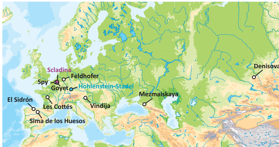
Fig. 1. Sites from which partial to complete nuclear genomes from Neandertals (or their ancestors in Sima de los Huesos) were retrieved. References (1, 6, 8, 20, 34–36) describe Neandertal genomic data from these sites. The origins of the two Neandertals studied here are highlighted in purple and blue, respectively.