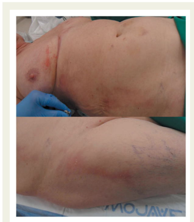
Figure 1 First- and second-degree burns were visible on a line going from the left shoulder along the entire torso to the lower right extremity.

We present a case of an 80-year-old woman who was struck by lightning. The past medical history included a diagnosis of arterial hypertension, coronary artery disease, anterolateral myocardial infarction 5 years earlier treated by primary coronary angioplasty of left anterior descending coronary artery with stent placement (bare metal stent), implantation of a DDD pacemaker 4 years earlier due to sick sinus syndrome (Talos DR, Biotronik; Selox JT53 endocardial lead in RAA and Selox ST 60 in RVA with passive fixation). She was struck by a lightning bolt while she was standing by a bike, with one hand resting on the handlebar and the other holding up an umbrella with a metal frame and a mobile phone (the patient does not remember in which hand she was holding the phone). As a result she experienced a transient loss of consciousness. The undamaged phone was found by a witness 10 m away from her and her wristwatch had stopped at the moment of strike. The patient in grave general condition with the symptoms of shock was admitted to the intensive care unit (ICU) of a district hospital. First- and second-degree burns were visible on a line going from the left shoulder along the entire torso to the lower right