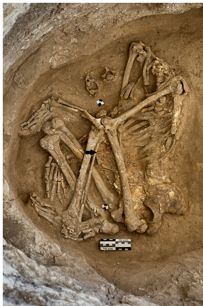
Fig. 2. Çatalhöyük burial F.2232 is a headless young adult female (13162) with a fetal skeleton (13163; arrow) in her abdominal region. The 2 individuals were the first in a sequence of interments in a burial pit in the east platform of Building 60, dating from the Late Period occupation at Çatalhöyük. Skull removal was an element of mortuary treatment in this Neolithic setting.

Addressing questions about lifestyle and quality of life in such a large Neolithic settlement provides a unique perspective for developing an understanding of the level of commitment to production and consumption of domesticated food products, the amount of labor and workload demands invested in feeding and sustaining the community over the course of its occupation history, and the types of social and behavioral patterns associated with these practices. The period of 7,000 to 9,000 y ago is a critical time for this community, representing the inception and evolution of sedentism, labor demands and lifestyle, dependence