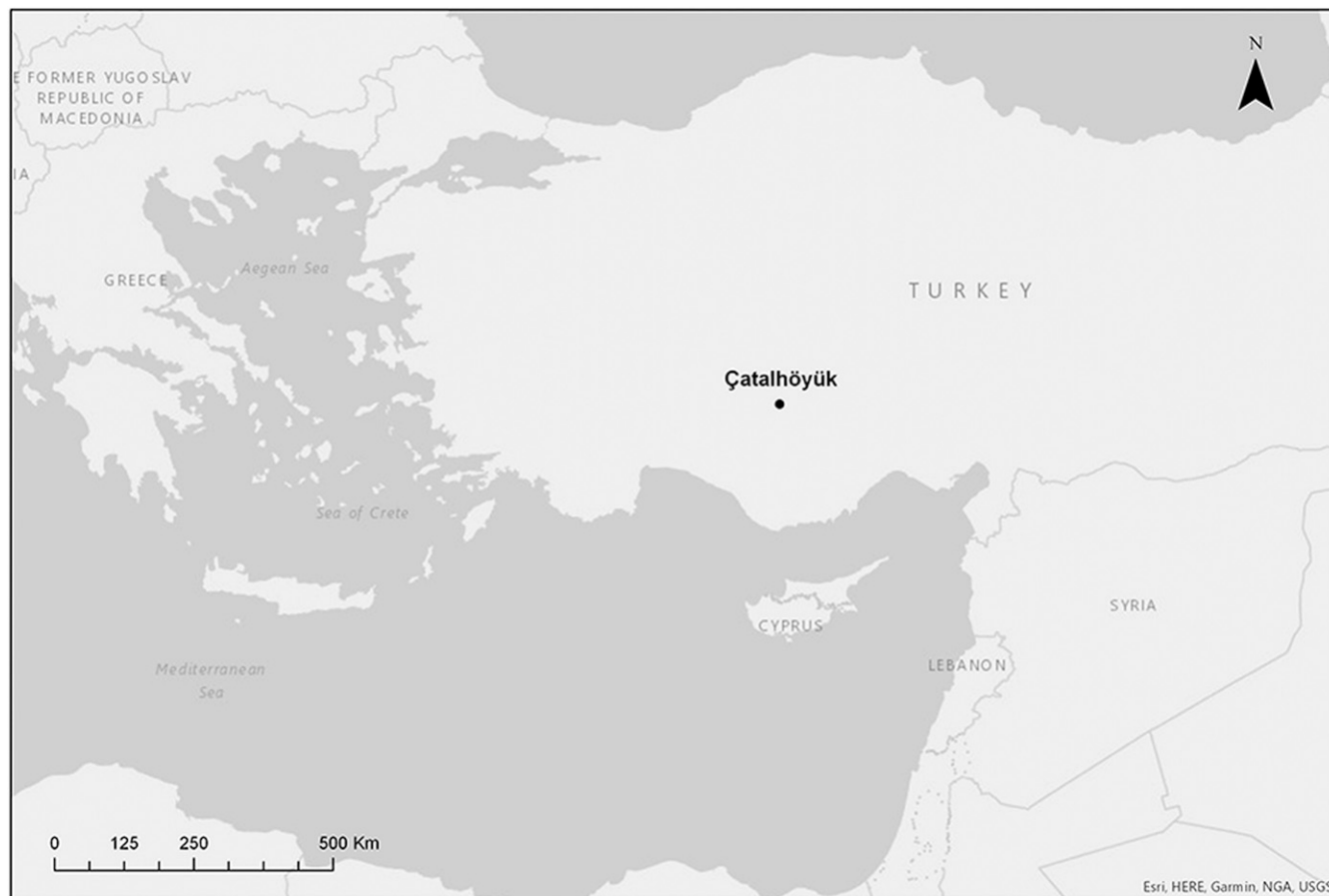
Fig. 1. Regional map of Turkey and the Mediterranean basin showing location of Çatalhöyük.

One such community is Neolithic Çatalhöyük, located in the Konya Plain on the Anatolian plateau of south-central Turkey (Fig. 1). Çatalhöyük includes the material remains of one of the