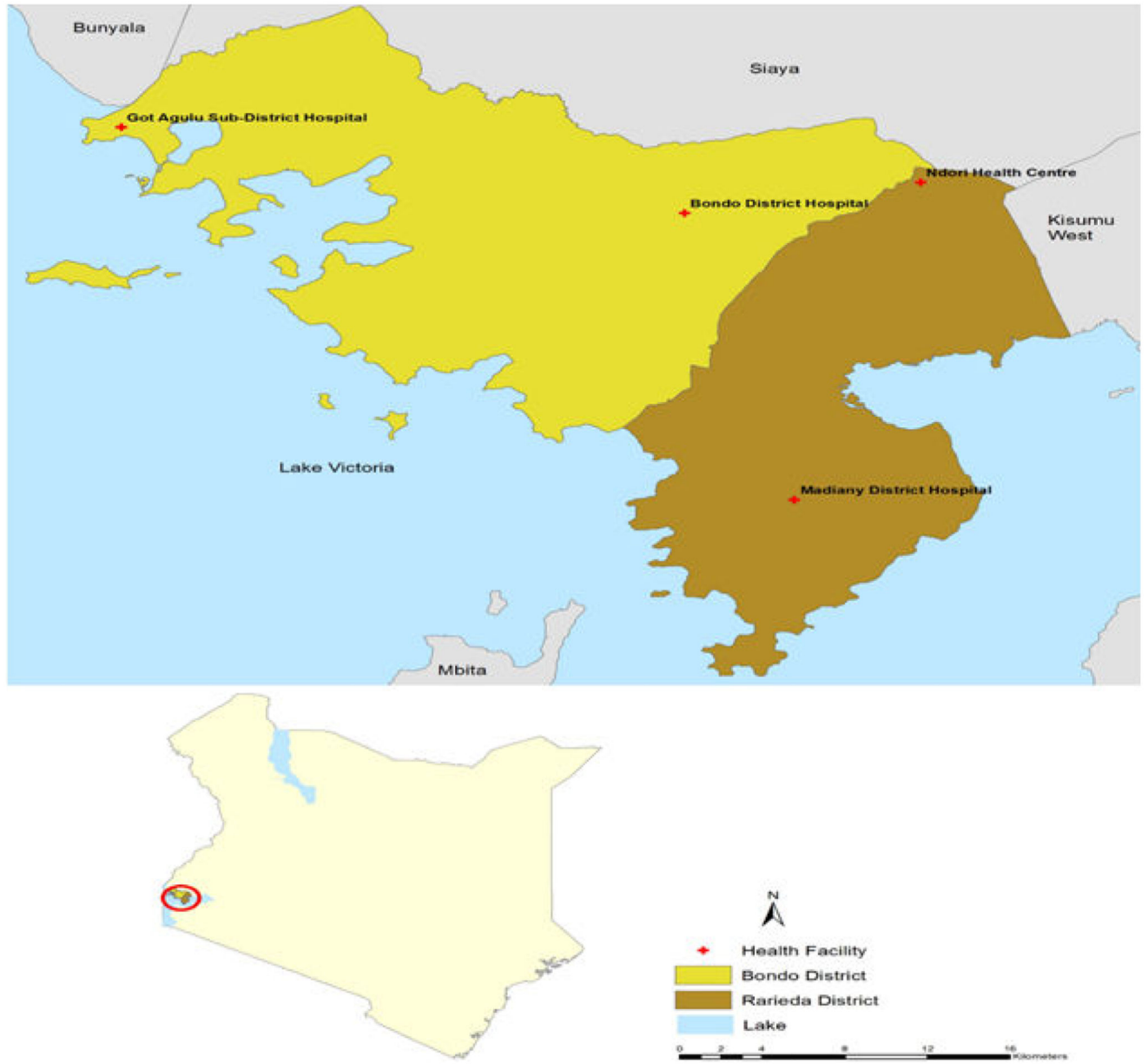
Figure 1. All trial sites.