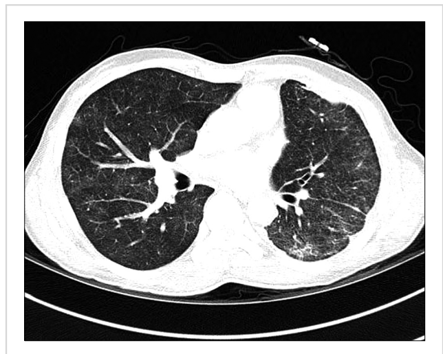
Fig. 1. Computed tomography scan of the chest. Lung setting view image showed diffuse subtle ground glass opacities in the hemithoraces, and atypical pneumonia such as viral infection, pneumocystis pneumonia, miliary TB, or drug-induced pneumonitis was suspected.

Initially, intravenous methylprednisolone and intravenous piperacillin/sulbactam were administered based on our suspicion of interstitial lung disease and superimposed