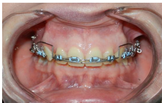
Figure 2: Maxillary incisor intrusion using the intrusive arch (start of treatment)

In group 2 intrusion of upper incisors was done using an intrusive arch that was fabricated using 0.017" x 0.025" TMA (Ormco) wire and placed in the auxiliary slot of the maxillary bands. It was activated with a Tweed loop plier (Pin Tech Instruments, Sialkot, Pakistan) to produce an intrusive force of 100 g as applied and measured using the same force gauge.