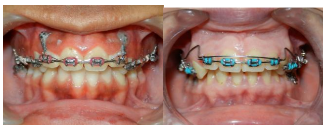
Figure 4: Maxillary incisors intrusion using (left) miniscrews and (right) intrusive arch

The intrusive arch group showed statistically significantly higher mean an increase in overjet than Miniscrew group. There was no statistically significant difference between mean changes of other cast measurements in the two groups.