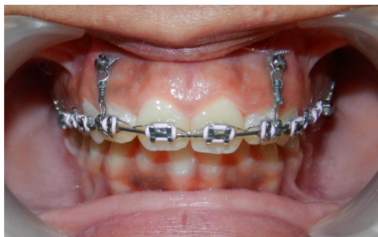
Figure 1: Maxillary incisors intrusion using mini-screws (start of treatment)

In group1 intrusion of maxillary incisors was done using two miniscrews (Jeil medical Co., Seoul, Korea), 1.4 mm in diameter and 6 mm in length. The miniscrews were placed at the mucogingival junction distal to the maxillary lateral incisors. The miniscrews were loaded 2 weeks later with medium super-elastic nickel-titanium closed-coil springs (3M Unitek™ TAD constant force coil spring 3 mm medium force). A force of 100g was measured using a calibrated Dontrix gauge (Correx; Ortho Care, Saltaire, United Kingdom).