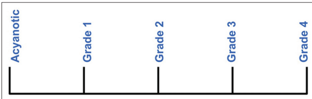
Figure 1: The visual analog scale of cyanosis severity

pressure (PaCO 2 ); thus, end-tidal capnometry is widely used in clinical practice to estimate PaCO 2 . Today, the end-tidal capnometry has become a basic and standard procedure for respiratory monitoring during anesthesia and recovery, [14,15] ICU, [16-18] and at emergency departments (ED). [19,20] Takano et al. studied the utility of the portable capnometer in general wards or in-home care practice in spontaneously breathing patients and reported that expiratory capnometry gives a reliable estimate of PaCO 2 and can be useful to evaluate the respiratory condition of spontaneously breathing patients. [21] Yosefy et al. aimed to verify whether ETPCO 2 can accurately predict PaCO 2 and variables that may affect this correlation in patients who referred to ED for respiratory distress. They reported a good correlation between ETCO 2 and PaCO 2 , and showed that DPCO 2 had an inverse correlation with age. [19] In some anesthetized patients or other patients with increased pulmonary dead space, DPCO 2 may increase significantly. [7] In most CHD patients, because of abnormal cardiopulmonary physiology, DPCO 2 increases; thus, it is often recommended to monitor PaCO 2 directly for respiratory setup. [16,22]