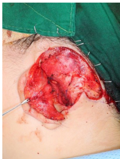
Fig. 1. Acellular dermal matrix was carved as wedge shape and grafted at the posterior auricular sulcus with 5-0 Prolene.

A 9-year-old female patient visited the outpatient clinic and presented with left-sided cryptotia. Because of the asymmetri-