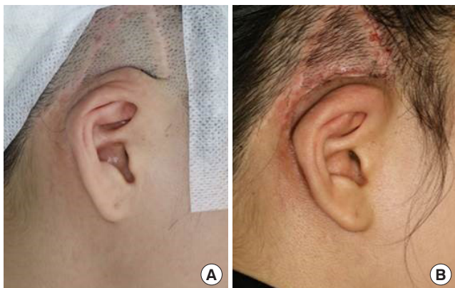
Fig. 4. (A) Recurred cryptotia: the skin flap added in the previous operation had bulged upward. (B) Postoperative image: enough ear projection was recovered.

of the upper helix. In addition, the skin flap added in the previous surgery was bulging upward (Fig. 4).