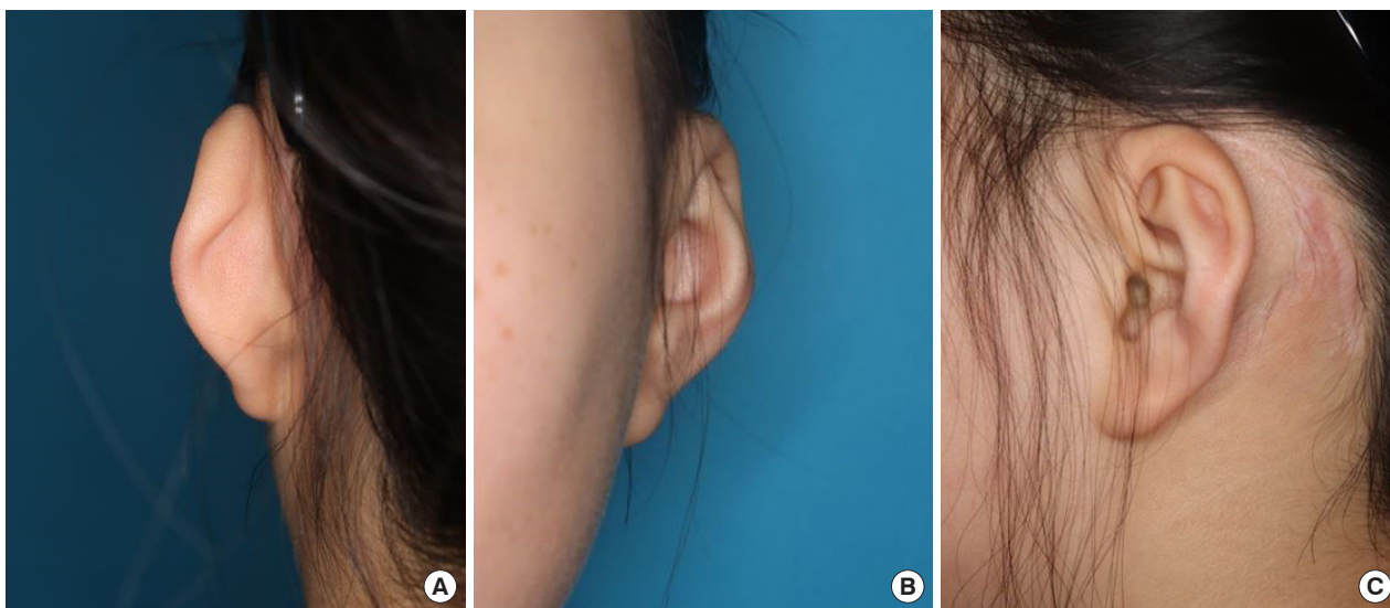
Fig. 3. Postoperative image of the left ear. Cephalo-auricular angle was deep enough, and the hairline was not disturbed after the surgery. (A) Posterior view, (B) anterior view, and (C) lateral view.

cal shape of the ear and the difficulty wearing glasses, surgical correction was requested. Physical examination revealed mild cryptotia, but the cephalo-auricular sulcus was shallow. It was confirmed as a transverse type of cryptotia in which the body and the superior crus of the antihelix are contracted (Fig. 2).