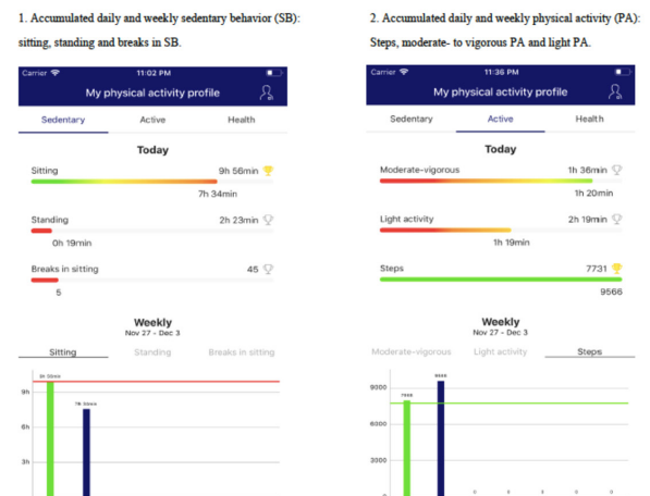
Figure 2 The contacts with the eHealth intervention patient and the view of the ExSed application for eHealth intervention patients.

goals online to make them more suitable for each patient (figure 2).