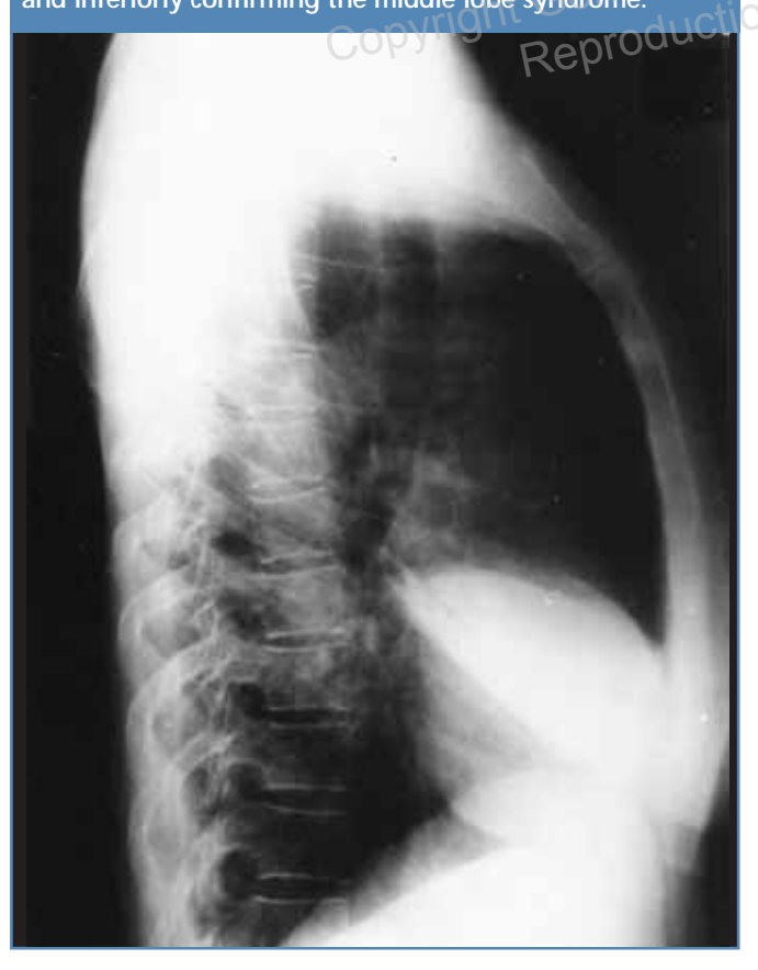
Figure 2. Chest roentgenogram (lateral view) showing a wedge-shaped density extending from the hilum anteriorly and inferiorly confirming the middle lobe syndrome.