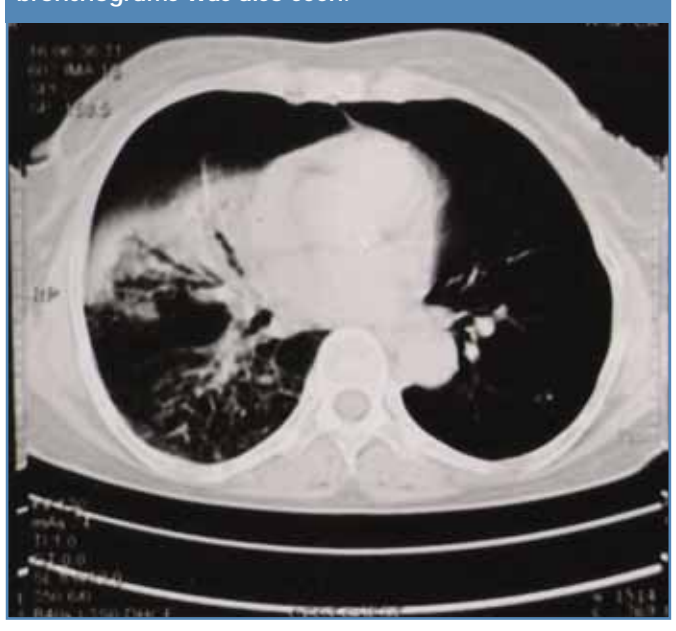
Figure 3. Contrast enhanced computed tomography of the thorax showing the multifocal nature of bronchial stenosis. Consolidation of the right middle lobe with air bronchograms was also seen.