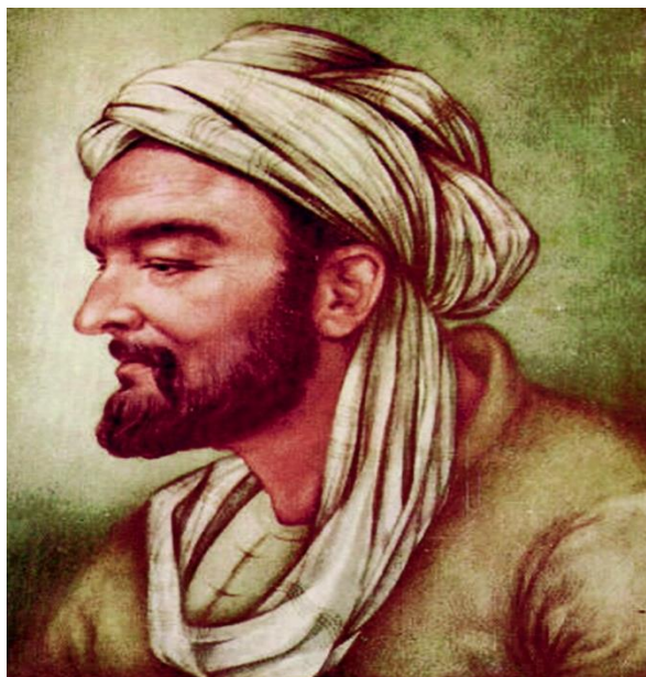
Figure 4. Ibn Sina (Avicenna) (980-1037 AD)

Finally, modern medicine started with the establishment of Dar al-Funun in 1851 for training physicians academically under the supervision of European and American teachers. 43 This was the first time the fields of medicine was separated, and the primary rules of each specialty were mainly derived from the European medical schools; some scholars completed their medical education in European countries. 43 Given said that, all the achievements of Iranian physicians and scientists were separated as traditional medicine and considered as a subsidiary field. University of Tehran, Tehran, Iran, was the first modern university in Iran which was established in 1934 and considered as the mother university in Iran (Figure 5). 44 The School of Medicine of Tehran University was established in 1934 which is still the most well-known center of medical education in Iran. 44