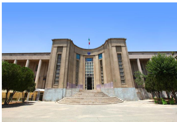
Figure 5. Tehran University of Medical Sciences

Finally, modern medicine started with the establishment of Dar al-Funun in 1851 for training physicians academically under the supervision of European and American teachers. 43 This was the first time the fields of medicine was separated, and the primary rules of each specialty were mainly derived from the European medical schools; some scholars completed their medical education in European countries. 43 Given said that, all the achievements of Iranian physicians and scientists were separated as traditional medicine and considered as a subsidiary field. University of Tehran, Tehran, Iran, was the first modern university in Iran which was established in 1934 and considered as the mother university in Iran (Figure 5). 44 The School of Medicine of Tehran University was established in 1934 which is still the most well-known center of medical education in Iran. 44