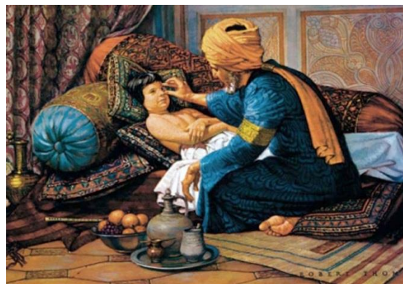
Figure 3. Rhazes (865-925 AD)

Avicenna used physical examination and history taking in his diagnostic procedure and his great medical book, named "The Canon of Medicine", was the main reference of medicine in the western countries until the 16 th century. 9 Zakariya al-Razi was an alchemist before his medical studies who took a significant step in the Persian pharmacology. 36 Rhazes, the great chemist, mathematician, physician, and astronomer was the first to challenge previous scientists like Galen and reject their errors, like the existence of a bone in heart base. 28 Rhazes (Figure 3) 37 and Avicenna (Figure 4) 38 as well as Al-Majusi Ahvazi also reported cancer, the different types and anti-cancer herbal medicines, and surgical treatment for its removal. 39 The most significant advances in medicine have been recorded at this period by the great work of these scientists; Iranian reports indicate the diagnosis of several diseases at that time like Leishmaniasis, 40 facial palsy and spasm, 41 and anatomy. 42