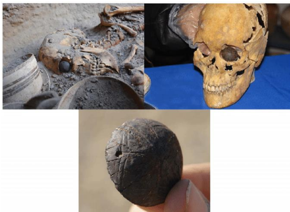
Figure 1. The earliest artificial eye found by Iranian archaeologists in Shahr-e-Sukhteh, Iran

13-year-old girl with congenital hydrocephalus, who underwent surgery for removing a part of her skull. 32 Based on the investigations, the patient lived for more than six months after the surgery. 32