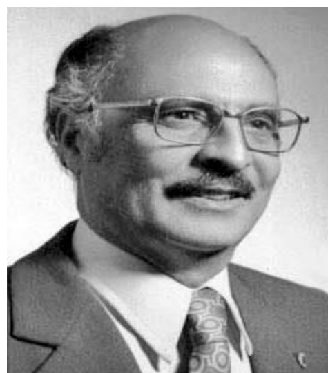
Figure 6. Professor Seyed Ebrahim Chehrazhi, the father of modern neuropsychiatry in Iran

In 1929, Dr. Ebrahim Chehrazhi (Figure 6), 58 "The father of modern neuropsychiatry in Iran", was chosen by the government for a scholarship to go to Paris to study medicine.