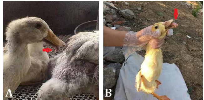
Fig.1. A and B) Cherry Valley ducks with typical signs of BADs (short beak with protruding and drooping tongue, red arrows) occurred in a duck farm in Dazu (Chongqing municipality), southwestern of China.

cavity. The results showed that the duck embryos died 84 to 144 hr after inoculation through sequential passage for three times. The infected allantoic fluids were collected, concentrated and purified by polyethylene glycol -6000 (Sangon Biotech) precipitation. Then, the purified samples were examined using a hemagglutination test according to Johnston et al. 6 Results indicated that the isolated pathogen could not agglutinate chicken red blood cells.