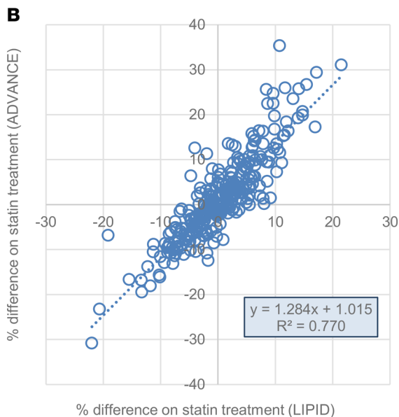
Figure 2. Association of statin treatment with percentage difference of lipid species and classes. (A) Percentage difference between statin-treated and untreated participants of the LIPID study (taken at the 12-month time point; n = 4991 ) and the ADVANCE study (taken at baseline; n = 3779 ). The percentage difference values were analyzed against statin treatment in a linear regression analysis, adjusted for age, sex, BMI, cholesterol, HDL-C, and triglycerides. (B) Correlation between the percentage difference between statin-treated and untreated participants in the LIPID study and ADVANCE study as analyzed via a linear regression. CE, cholesteryl ester; Cer, ceramide; COH, free cholesterol; DG, diacylglycerol; dhCer, dihydroceramide; GM3, G_{M3} ganglioside; HexCer, monohexosylceramide; Hex2Cer, dihexosylceramide; Hex3Cer, trihexosylceramide; LPC, lysophosphatidylcholine; LPC(O), lysoalkylphosphatidylcholine; LPE, lysophosphatidylethanolamine; LPI, lysophosphatidylinositol; PC, phosphatidylcholine; PC(O), alkylphosphatidylcholine; PC(P), alkenylphosphatidylcholine; PE, phosphatidylethanolamine; PE(O), alkylphosphatidylethanolamine; PE(P), alkenylphosphatidylethanolamine; PG, phosphatidylglycerol; PI, phosphatidylinositol; PS, phosphatidylserine; SM, sphingomyelin; TG, triacylglycerol.