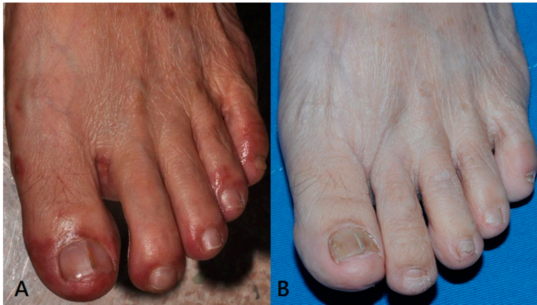
Figure 1. (A) In the acute stage, the cutaneous lesions, such as erythematous papules and pustules, around the nail matrix of the first, fourth and fifth toenails of left foot are relatively prominent than on the second and third toe; (B) about two months later, onychomadesis on the second and third toe of left foot.