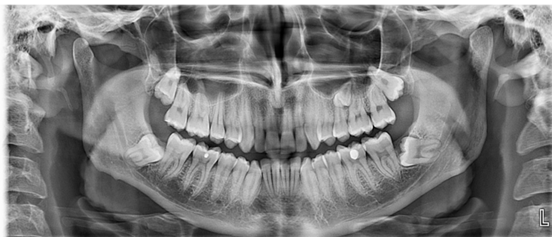
Figure 2. The four impacted third molars and the impacted paramolar are seen in the panoramic radiograph. The root of the paramolar seems to be close to the sinus maxillary wall.