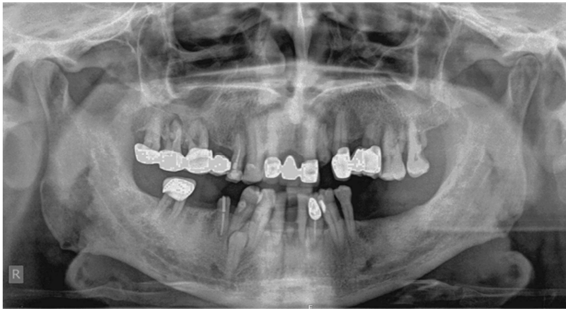
Figure 3. The parapremolar is located unilaterally, distally to the lower right canine.

formed parapremolar in the mandible, located diagonally with its crown mesial to the second left premolar and its apex distal to the left second incisor. In order to better evaluate the exact location of the parapremolar and the potential risk of root resorption to the adjacent teeth, a cone beam computer tomography (CBCT) was performed (Figure 5). As seen in the CBCT the parapremolar was located lingually. The supernumerary tooth as a whole was lingually located in the root of the lower left first premolar and was tangent to the latter. In particular, the distal portion of the supernumerary tooth's crown was located proximal to the middle third of the root of lower left second premolar. The root of the supernumerary was located lingually and slightly below lower left canine. Moreover, it presented an abnormal morphology. The patient did not want to proceed with a surgical extraction of the supernumerary tooth and so observation was decided upon instead.