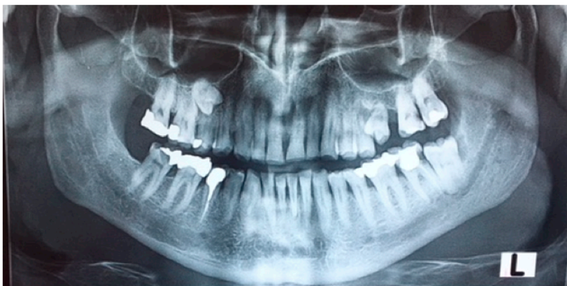
Figure 1. As seen in the panoramic radiograph of the father, the paramolars are located bilaterally in the maxilla. The right one is impacted, while the left one is partially erupted after the extraction of the first left molar.