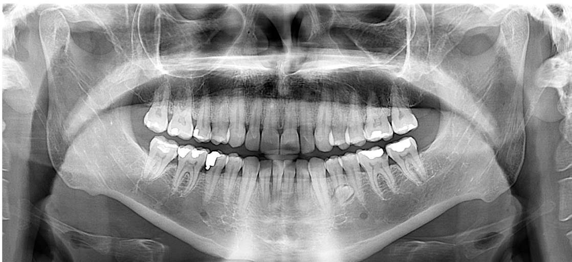
Figure 4. An incidental finding was the parapremolar on the left side of the mandible, located diagonally with its crown mesial to the second left premolar and its apex distal to the left second incisor.