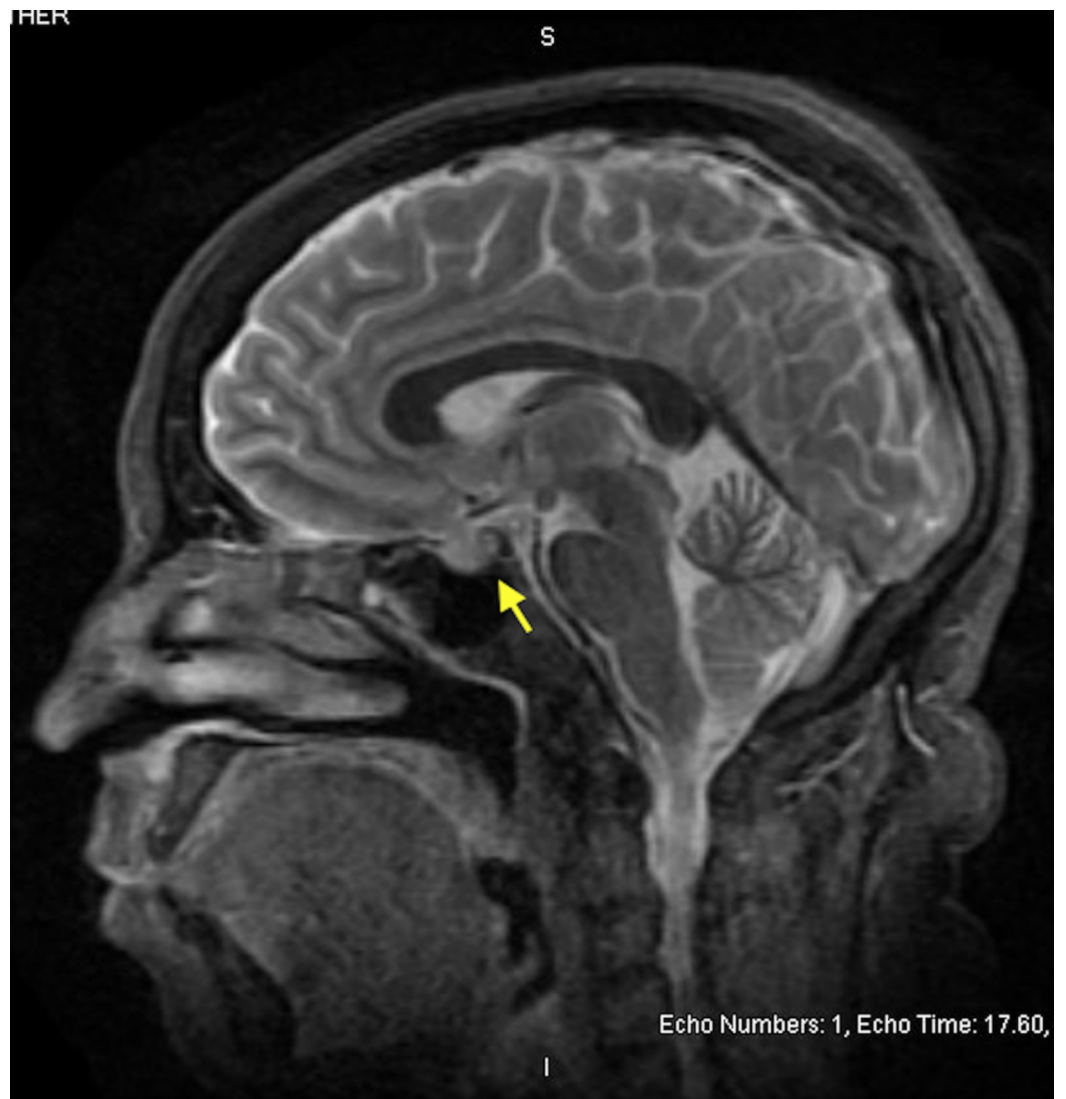
FIGURE 3: MRI brain in sagittal section showing abnormal enlargement of the pituitary gland (yellow arrow) with extension into the supra-stellar cistern abutting the undersurface of optic chiasm.

The patient responded to oral corticosteroid therapy with significant improvement in pain, discharge, and breast wound. However, due to recurrence of the symptoms with discontinuation of prednisone, she remained on 10 mg prednisone daily at the end of eight months. The plan is to add methotrexate as a steroid sparing agent. She established care with endocrinology for further management of prolactinoma and she was started on bromocriptine 2.5 mg once daily dose.