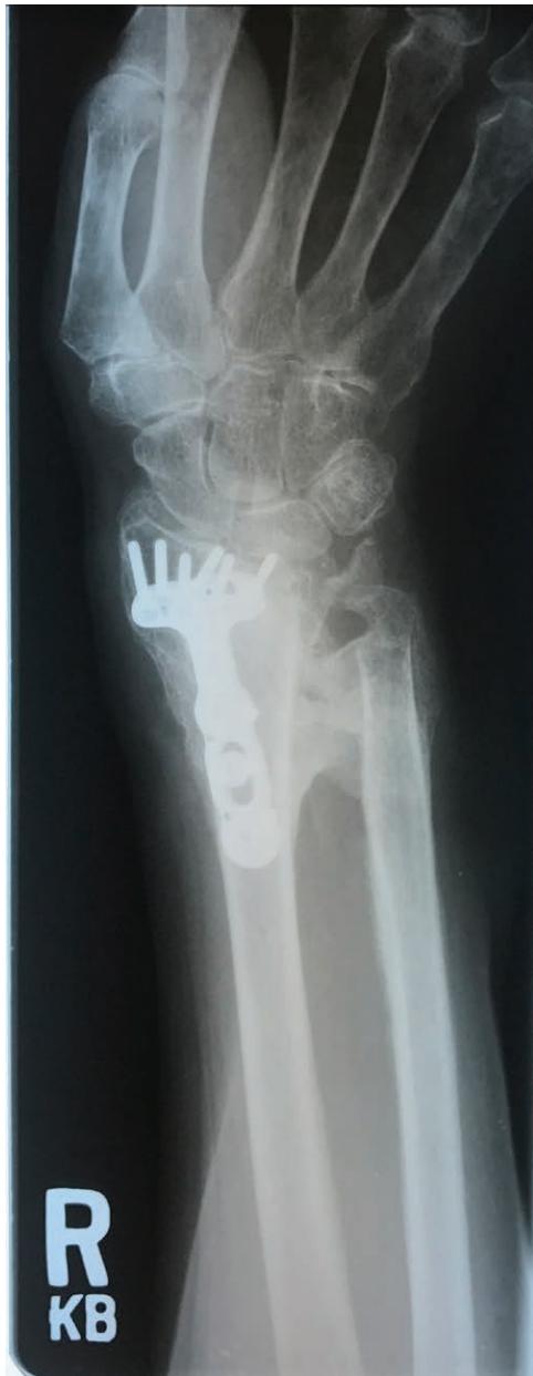
Fig. 5. Patient 2 preoperative roentgenogram showing heterotopic ossification of the right distal radius and ulna.

Although autogenous tissue has promising results in a limited number of studies, Failla et al 3 in their series of post-traumatic proximal radioulnar synostosis observed superior outcomes in patients treated with the interposition of nonbiologic material (silicone) as compared with a biologic substance such as muscle, fascia, and fat. The proposed reason for this is an increase in scarring caused by the autogenous tissue. Similar to silicone, Lytle and Chung 9 described a case of a distal radioulnar synostosis treated with Integra dermal regeneration template (Integra Bilayer Matrix Wound Dressing; Integra Life Sciences, Plainsboro, NJ) and postoperative NSAID use with a successful result at 1 year.