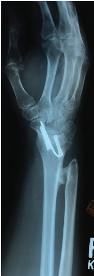
Fig. 1. Patient 1 preoperative roentgenogram showing heterotopic ossification of the right distal radius and ulna.

She was taken to the operating room, and after axillary block anesthesia, the extremity was exsanguinated and a tourniquet inflated. A longitudinal incision was made along the ulnar side of the dorsum of the distal extremity. The extensor carpi ulnaris tendon and the ulnar sensory