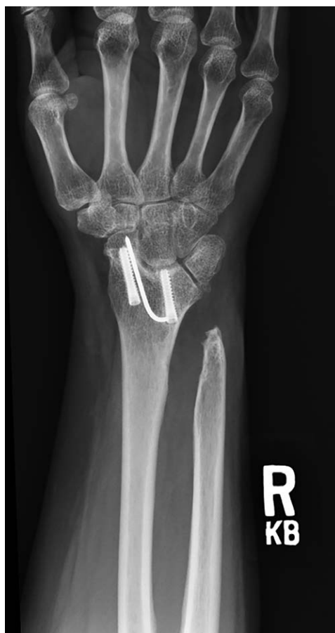
Fig. 4. Patient 1 9-month postoperative roentgenogram showing no recurrence of heterotopic ossification.

Though no comparative study is large enough to show significance, the existing data suggest that providing an effective barrier between the radius and ulna helps prevent the recurrence of heterotopic ossification. Multiple studies use autogenous tissue interposition for the treatment