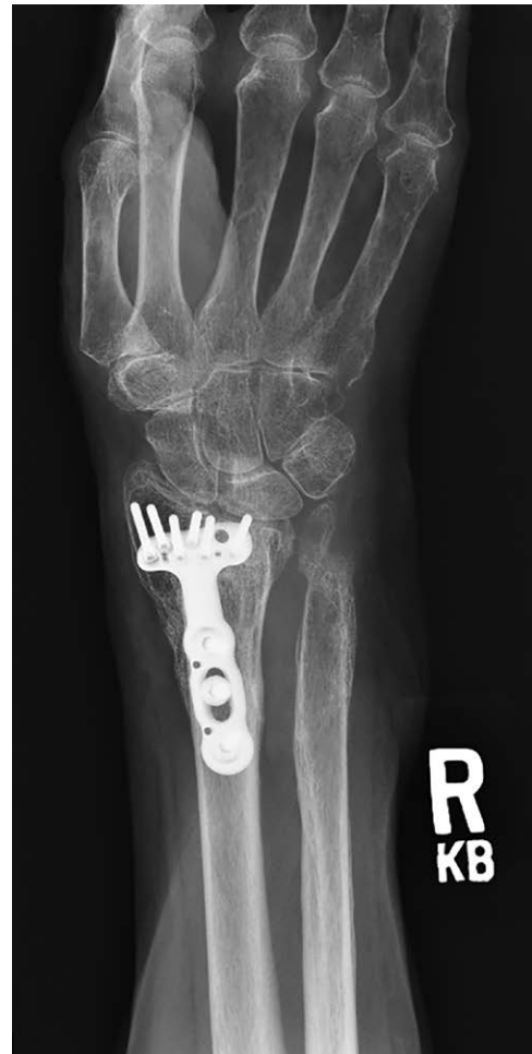
Fig. 6. Patient 2 8-month postoperative roentgenogram showing no recurrence of heterotopic ossification.

Although autogenous tissue has promising results in a limited number of studies, Failla et al 3 in their series of post-traumatic proximal radioulnar synostosis observed superior outcomes in patients treated with the interposition of nonbiologic material (silicone) as compared with a biologic substance such as muscle, fascia, and fat. The proposed reason for this is an increase in scarring caused by the autogenous tissue. Similar to silicone, Lytle and Chung 9 described a case of a distal radioulnar synostosis treated with Integra dermal regeneration template (Integra Bilayer Matrix Wound Dressing; Integra Life Sciences, Plainsboro, NJ) and postoperative NSAID use with a successful result at 1 year.