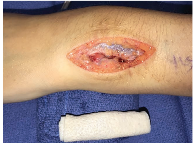
Fig. 2. ADM construct prepared in a cigar-like fashion before implantation.

nerve were identified and retracted. The slips of the extensor digitorum communis tendons were elevated from the soft tissue, exposing the heterotopic ossification. With intraoperative fluoroscopy, the heterotopic bone was completely resected with the aid of a sagittal saw, osteotome, and rongeur. Afterward, the forearm could be supinated and pronated without difficulty.