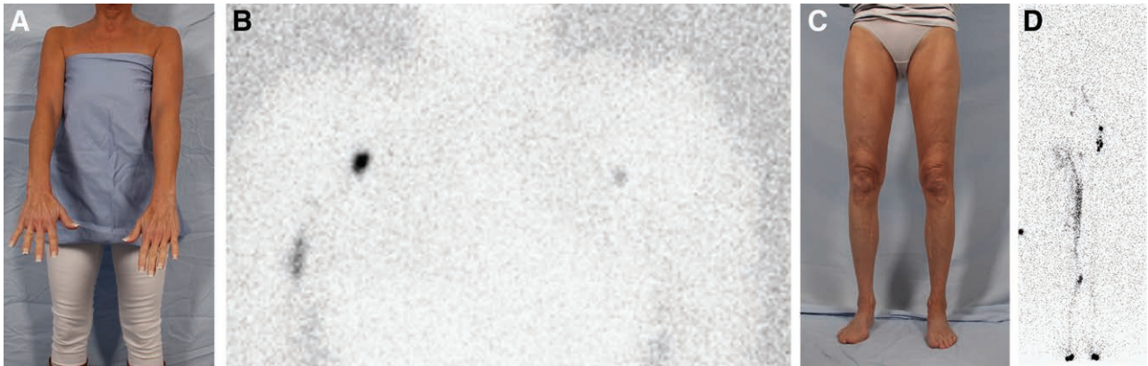
Fig. 3. Patients with a false-negative Stemmer sign. A and B, 50-year-old woman with primary left upper extremity lymphedema (BMI, 22). Her lymphoscintigram image at 45 minutes shows reduced flow of radiolabeled tracer to her left axillary nodes (Table 2, patient #5). C and D, 61-year-old woman with a secondary right lower extremity lymphedema (BMI 16; Table 2, patient #8). Her lymphoscintigram image at 45 minutes illustrates absence of right inguinal node uptake of radiolabeled tracer and dermal backflow.

the disease and a specificity of 57% to exclude lymphedema in patients who do not have the condition. Thus, we conclude that the test is a useful component of the physical examination in patients with suspected lymphedema. It is easy to perform and adds minimal effort when also evaluating the patient for pitting edema. Subjects with a positive finding are likely to have lymphedema, although obese individuals can exhibit the sign and have normal lymphatic function. A negative Stemmer sign does not rule out lymphedema, typically in patients with a normal BMI and stage 1 disease.