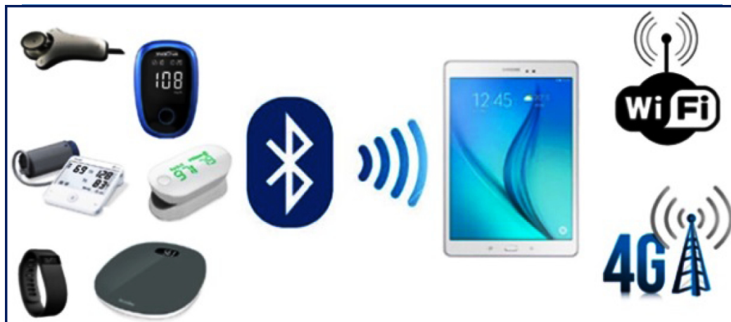
Fig. (2). E-care’s connected non-intrusive medical sensors.

More than 1,500 measurements were taken from these 175 patients, causing the E-care system to generate 700 alerts regarding 68 patients. During the monitoring period, 107 individuals (61.1%) produced no alerts. The follow-up study on those patients showed that they presented no clinical health events that could result in hospitalization. An