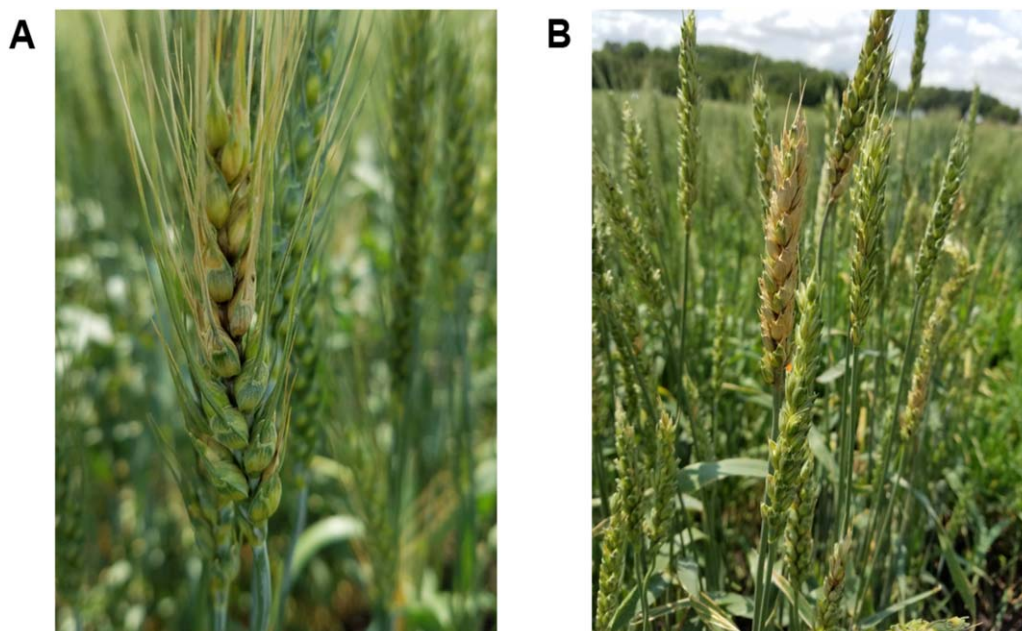
Fig. 3 Symptoms of Fusarium head blight/scab. (A) Early infection signs manifested as a partially bleached wheat head. (B) Advanced infection of Fusarium graminearum manifested as an almost completely bleached wheat head.