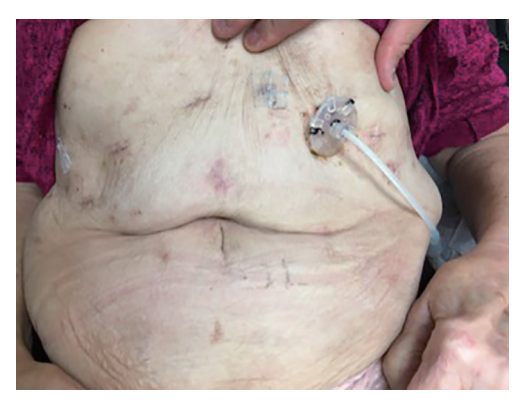
Figure 2 Feeding jejunostomy position on abdominal wall.