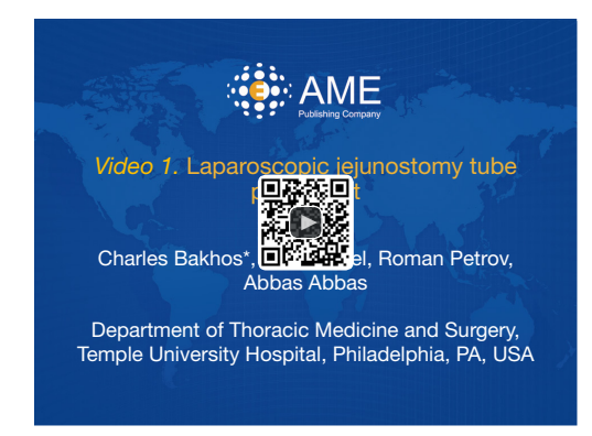
Figure 1 Laparoscopic jejunostomy tube placement (6). Available online: http://www.asvide.com/article/view/30883