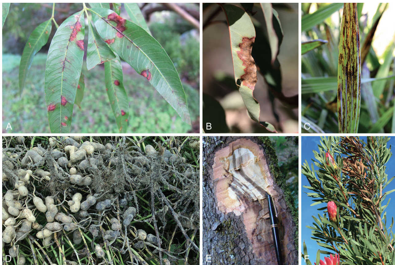
Fig. 1 Symptoms of diseases caused by fungi belonging to the groups illustrated in the phylogenetic trees (Fig. 2) and where a single genus name (alternatives in parentheses) will simplify many aspects of dealing with them. (A) Diaporthe rhusicola ( Phomopsis ) leaf spot on Rhus pendulina . (B) Leaf disease caused by Teratosphaeria ( Kirramyces ) cryptica on Eucalyptus sp. (C) Ramularia lamii ( Mycosphaerella ) leaf spot on Leonotus leonurus . (D) Black pod rot on peanut caused by Calonectria illicicola ( Cylindrocladium ). (E) Streaked discoloration of Platanus wood caused by Ceratocystis platani ( Thielaviopsis ). (F) Neofusicoccum protearum ( Botryosphaeria ) canker on Protea sp.

overwintering forms that often initiate new infections in new rotations (e.g. apple scab caused by Venturia inaequalis , anamorph Fusicladium pomi , synanamorph Spilocaea pomi ) (Schubert et al. , 2003).