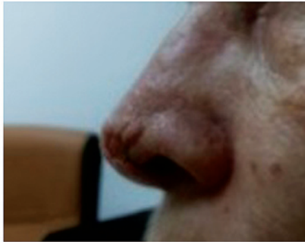
Figure 2. After receiving 3 injections complete remission was achieved after the third injection. At the end of the therapy, only a minor defect was present on the nose.

and pyrimidine nucleotide formation, which in turn requires the presence of THF to act as a co-factor for many enzymatic reactions (1,4,5).