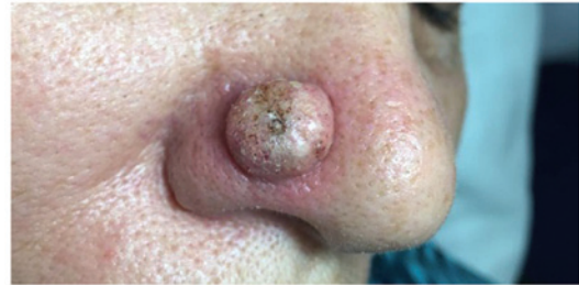
Figure 3. A 69-year-old female patient presented with a red dome-shaped nodule, 1.5 cm in diameter, near the alar crease of the nose, which was consistent with the diagnosis of keratoacanthoma.

The patients received 3 injections with intralésional MTX every 2 weeks, with a total dose of 60 mg. The tumor was