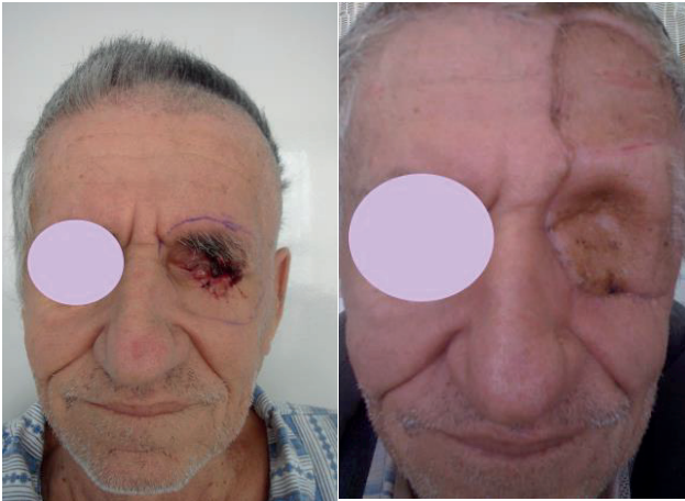
Figure 1. BCC of upper and lower eyelid Figure 2. Postoperative result eyelid

and in male patients (68.7%), SCC was the third most common eyelid malignancy (10.1%) and showed a male predominance (69.6%). According to histological analysis of the examined samples in our study, the highest number of tumors was BCC (85%), which were predominantly found on the lower eyelids (92.16%) and showed female predominance (51.06%). SCC was the second most common eyelid malignancy (15%) and showed a predilection for the lower eyelid involvement and male predominance (55.56%). Malignant lid tumors tended to locate in the lower eyelid, which could be attributed to most BCC with a predilection for the lower eyelid.