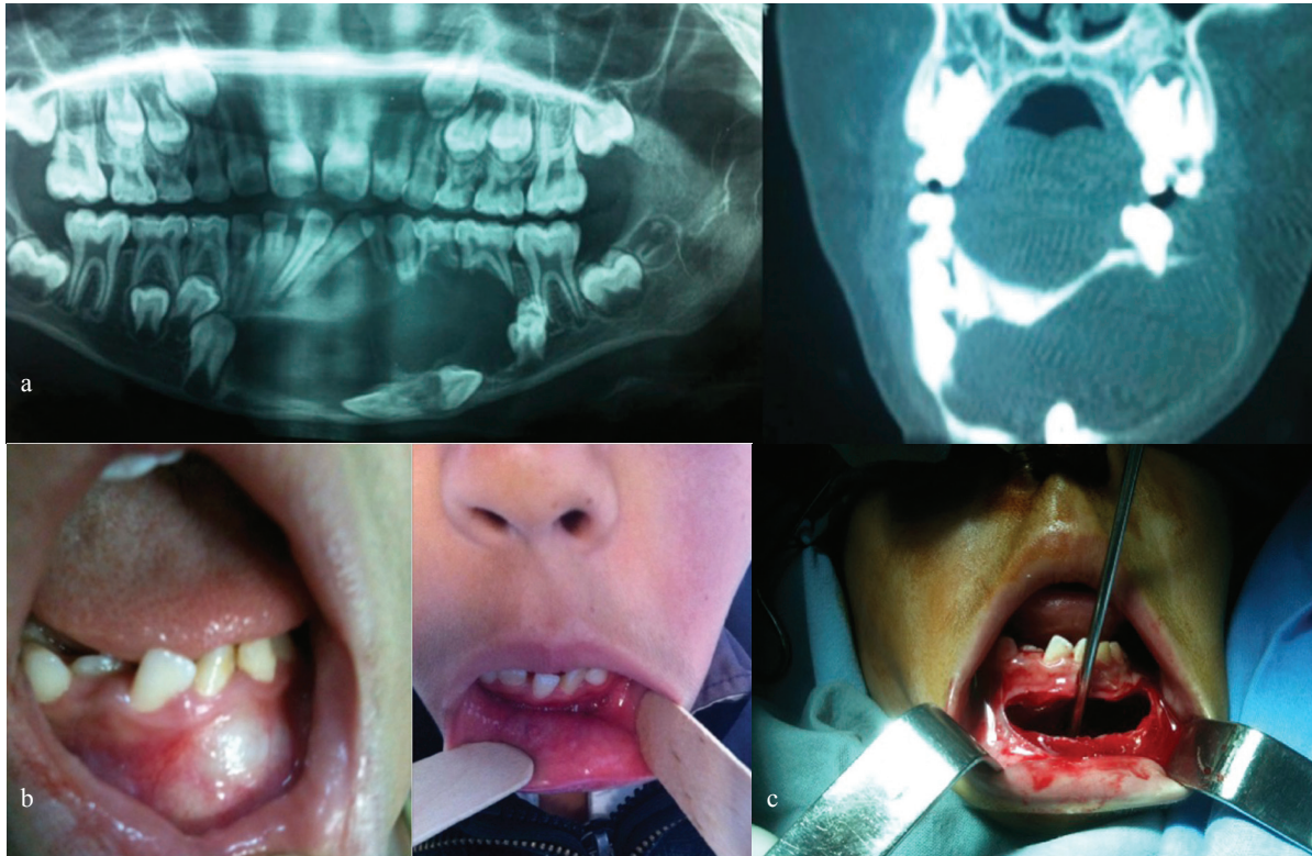
Fig. 1: a- Radiologic data: Orthopantomogram (OPG) and computed tomography scan with giant cyst of the mandible involving an included canine. b: Examination before marsupialization (a), and after 6 months (b). c: Intraoperative view after opening of cystic cavity.