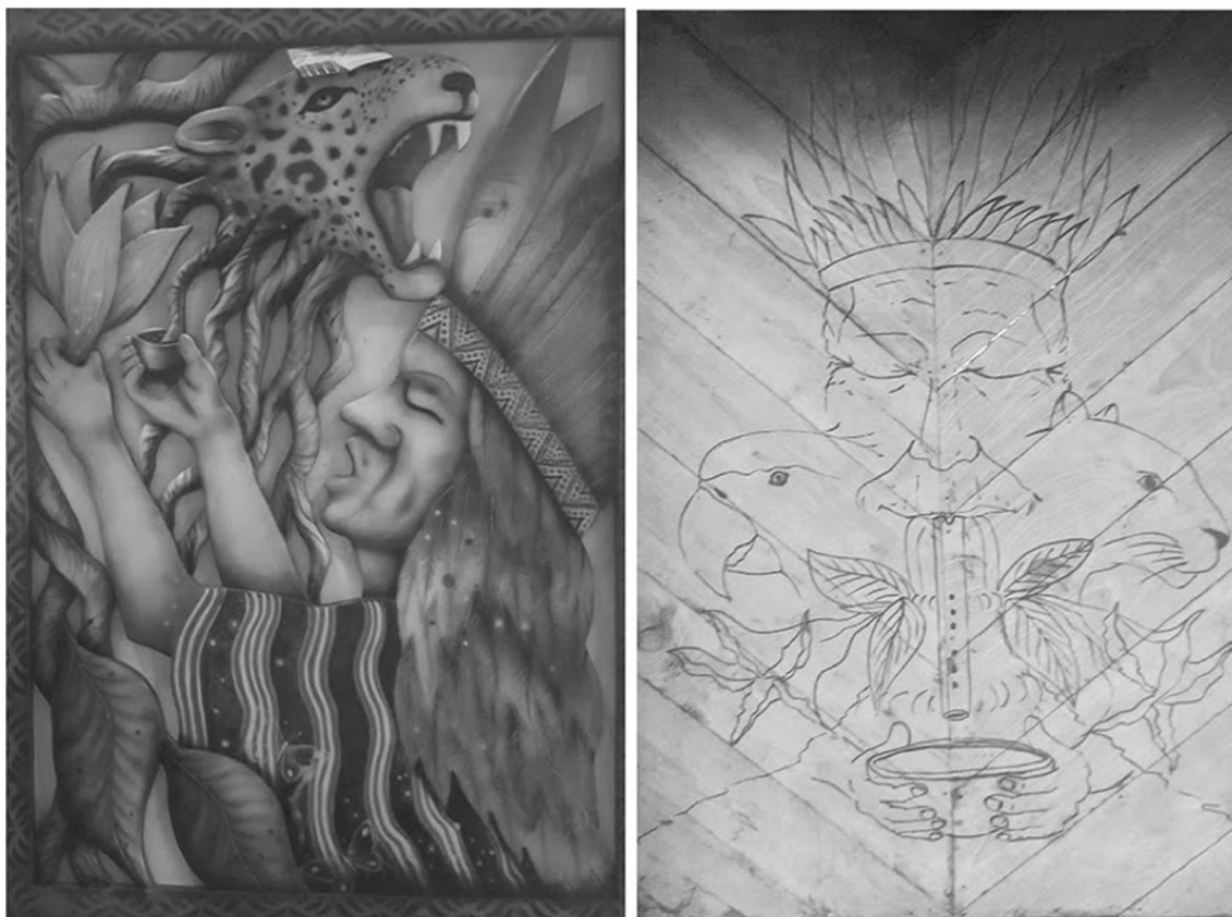
Fig. 2 Pictures of Shaman in ayahuasca ritual referring to leaves of P. viridis and lianas of B. caapi in a vase containing ayahuasca beverage, often accompanied by singing, culminating in the vision of a jaguar or birds. Left: Picture at Ambiaku Turistic Center, Municipal-