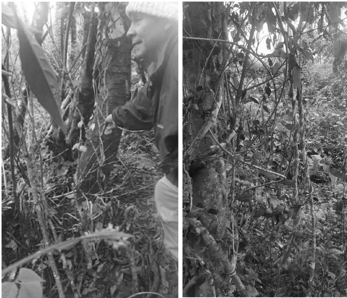
Fig. 1 Shaman Juan Mutumbajoy Jacanamijoy showing the lianas of Banisteriopsis caapi (Malpighiaceae) at Vereda Tamabioy, Municipality of Sibundoy, Putumayo, Colombia

Ayahuasca beverage is prepared basically from the bark of the lianas Banisteriopsis caapi (Malpighiaceae) (Fig. 1) or B. inebrians with additives from some other species [8], mainly Psychotria viridis (Rubiaceae), popularly called chacruna, which has been used for many purposes by natives [8]. In the majority of the syncretic churches,