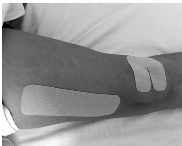
Figure 2. Sham kinesiotaping application (Group 2).

correction (Figure 1). [15] In the VMO facilitation, the interval between the superior anterior iliac spine and patella midpoint, while the patients were supine position was measured. The length of the tape was taken as the half of this interval. A 2-inch I strip of Kinesio® Tex Tape split to a Y. Tails of the Y strip prepared were considered as ½ of the tape length. The first part of the tape, which is called “base”, was applied without strain on the VMO body and lateral “Y” tail applied along the pes anserinus and ended on tibia, while on the knee extension. The patient was, then, asked to move his/her knee to full flexion. The medial “Y” tail was applied along the medial side of the patella and ended at the lower end of the patella. The rest excluding the first and last 5 cm of the tape was applied with 50% tension (Figure 1).