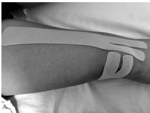
Figure 1. Vastus medialis obliquus facilitation and patellar kinesiotaping application (Group 1).