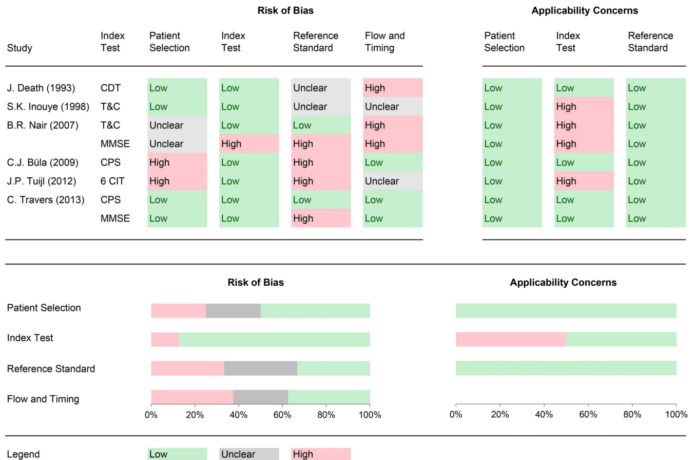
Fig 2. Risk of bias and applicability concerns graph. (A) Abbreviations: CDT: Clock Drawing Test; T&C: Time & Change Test; MMSE: Mini-Mental Status Examination; CPS: Cognitive Performance Scale; 6CIT: Six-Item Cognitive Impairment test.

https://doi.org/10.1371/journal.pone.0219569.g002