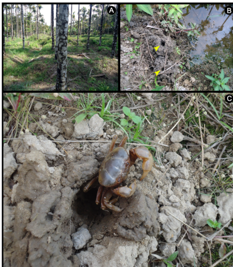
Figure 4 Habitat of Arcithelphusa cochleariformis sp. nov. at type locality, Ondayangadi. (A) Betel nut plantations; (B) burrows along water channels (yellow arrow head marks); (C) live crab near a burrow.

the first male gonopod in dorsal and lateral views that resembles lateral view of a spoon.