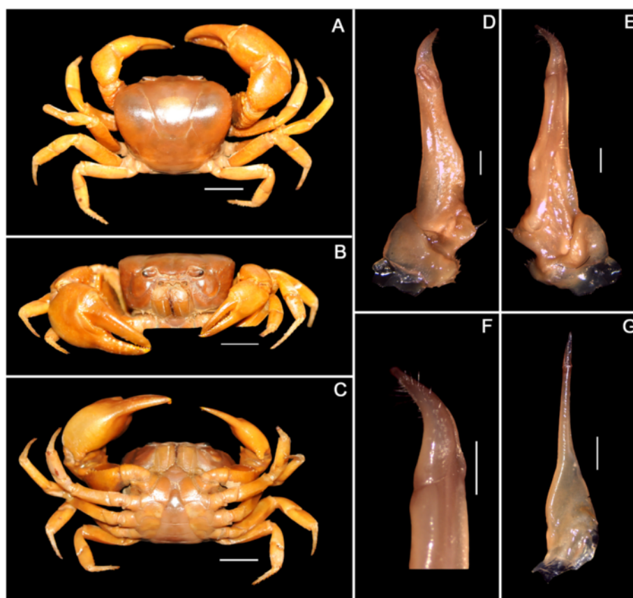
Figure 2 Arcithelphusa cochleariformis sp. nov., holotype male (ZSI, WRC-C.1188). (A) Carapace, dorsal view; (B) carapace, frontal view; (C) carapace, ventral view; (D) right G1, dorsal view; (E) right G1, lateral view; (F) right G1 terminal segment, lateral view; (G) right G2. Scale bars = 10 mm (A-C) and 1 mm (D-G).

25.76 mm, ch 22.24 mm, fw 7.40 mm), Ondayangadi, 5 km northeast of Mananthavady, Wayanad district, Kerala (11.82463552° N and 76.03024006° E), altitude 760 m, 16 November 2013, coll. Ammini (ZSI, WRC-C.1190).