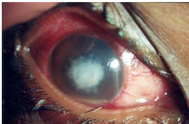
Figure 2. Fungal keratitis. (Republished with permission of Macmillan Publishers Ltd., from Thomas PA. Fungal infections of the cornea. Eye . 2003;17(8):852-62.)

Trauma is the inciting factor in approximately half of fungal keratitis cases. 25 Predisposing factors include immunosuppression (including that caused by acquired immune deficiency syndrome [AIDS]), diabetes mellitus, preexisting ulceration or other ocular surface disease, lid margin notches, inability to close eyelids (e.g. Bell's palsy), decreased lacrimation, decreased lacrimal immunoglobulin-A levels, refractive keratotomy and other procedures, and use of contact lens, especially with extended-wear lenses. 25,27 Fungal keratitis is much more common in developing countries. 25,26 There is significant geographic variation, even within the same country, regarding the proportion of keratitis that is fungal and the proportional distribution of the various fungal genera as etiologic