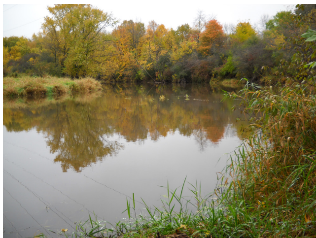
Figure 1. Representative surface body of freshwater. New fungi may enter the water from upstream, from adjacent shoreline, from atmospheric dust and from animal contact.

Tap water is a potential site of pathogenic fungal contamination and may be a particular concern even in urban areas of developing nations. cf.16 Depending on the municipality, or private water source owner, a variety of methods may be used to remove potentially harmful microorganisms from the water supply. 17 In the United States, where drinking water is considered “among the safest in the world,” 17 the most